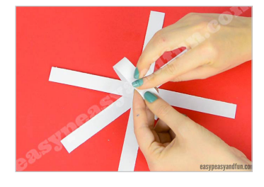
2. Now assemble the paper balls. If you don't know how you can check how we did it when making this paper ball garland, the procedure is the same, with the difference you'll be making two balls for one snowman.